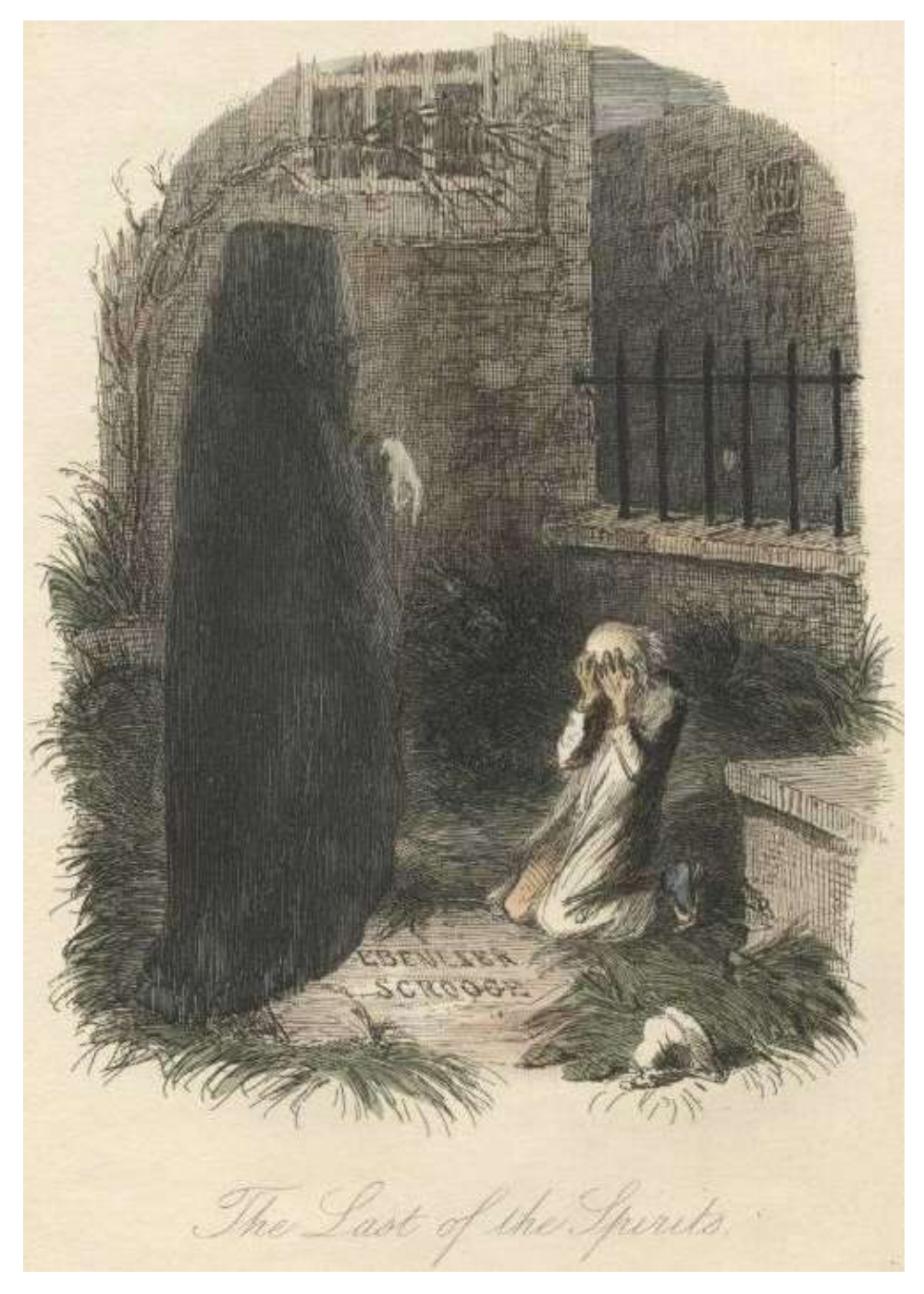
The Last of the Spirits

"Am I that man who lay upon the bed?" he cried, upon his knees.