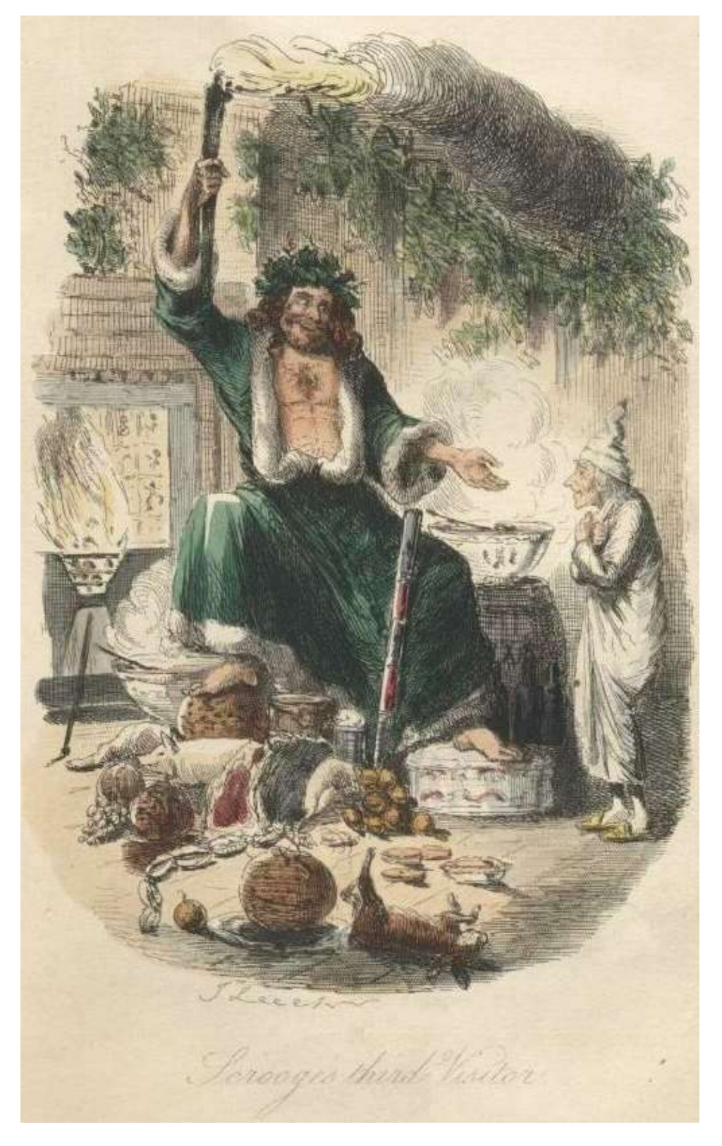
Scrooge's Third Visitor

"You have never seen the like of me before!" exclaimed the Spirit.